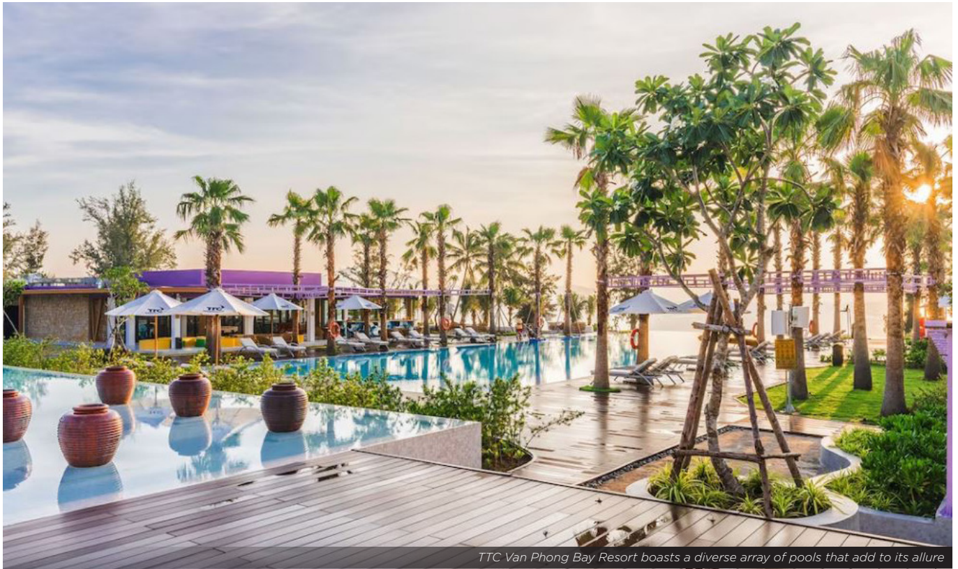
TTC Van Phong Bay Resort boasts a diverse array of pools that add to its allure