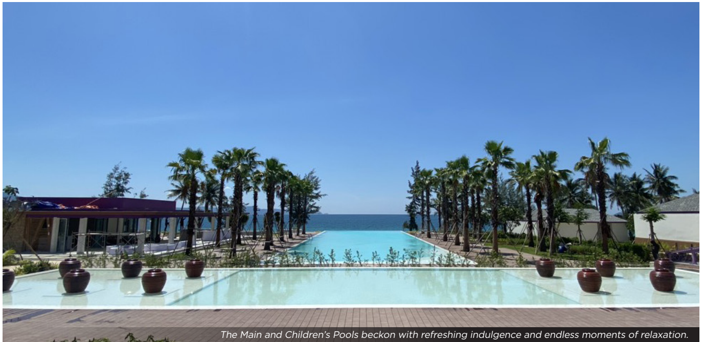
The Main and Children's Pools beckon with refreshing indulgence and endless moments of relaxation.