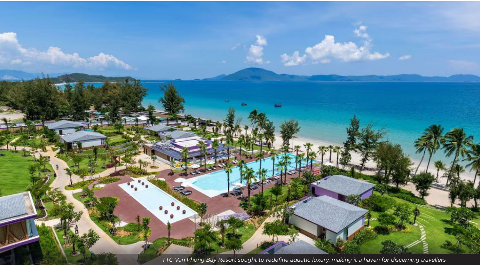
TTC Van Phong Bay Resort sought to redefine aquatic luxury, making it a haven for discerning travellers