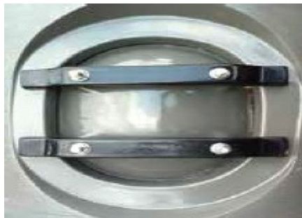
Waterco's elliptical positive sealing manways provide reliable access to the filter vessel for visual inspections and cleaning.

"Positive sealing manway, proprietary flat surface port boring process, strong flange engineering design, good backwash hydraulic, optional sight glass and large lateral manhole were key benefits that differentiated Waterco's filter from the competition," Steven explains.