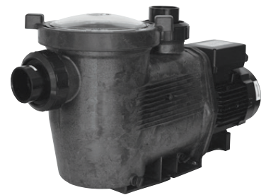
The Hydrostar's pump body is manufactured utilising state of the art engineering plastic moulding with a single piece strainer pot and volute for extra strength. A marine grade stainless steel mechanical seal is incorporated for extra protection against sea water.

was very satisfied," says the President of Wonjin Fisheries, Mr Lee Ju-Seuk.