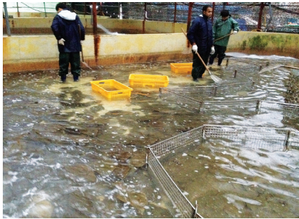
Sea water drawn in from the coast contains high levels of debris, which need to be filtered before passing to the land-based fish tanks or raceways.

Chungnam, which is considered South Korea's richest province, is home to Wonjin Fisheries Co. Ltd., a successful company that designs and builds aquaculture systems.