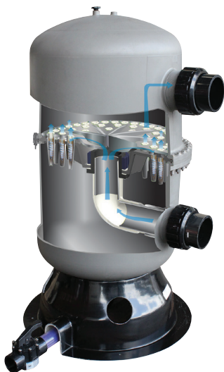
MultiCyclone 70XL is a brilliant pre-filtration device that works on the basis of centrifugal water filtration and is designed with no moving parts and no filter media to clean or replace.

Critical to the system is MultiCyclone's unique centrifugal water filtration technology, specifically the incoming water is channelled so that it enters multiple hydrocyclones tangentially, generating a strong centrifugal effect. This spins the sediment out to the hydrocyclone's wall and then spirals it down to the sediment sump, while the cleansed water spirals upwards and out of the filter.